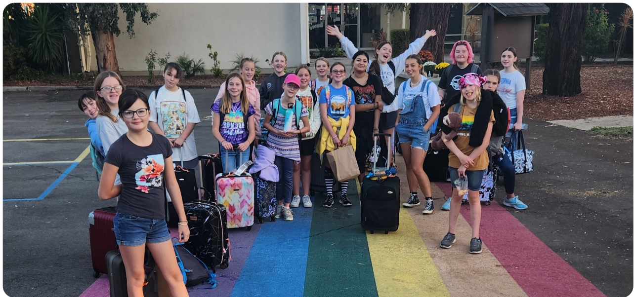
Check out this group of girls from GSU staying at a Girl Scouts of Greater Los Angeles property.