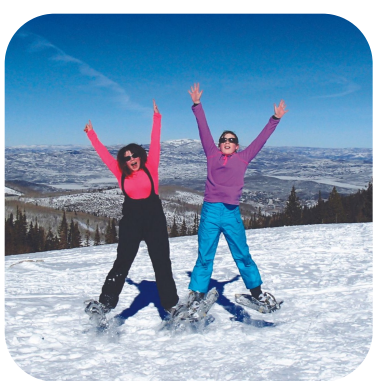
February Family Snowshoe Adventure Grades K12, Adults Register by March 22