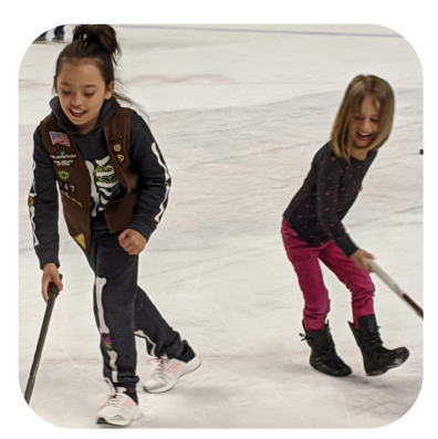
Girl Scout Grizzlies Night & Sleepover Grades K-12, Adults Register by January 15