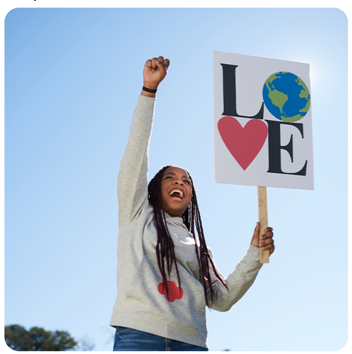
Global Girls Grades K-12 Register by April 23