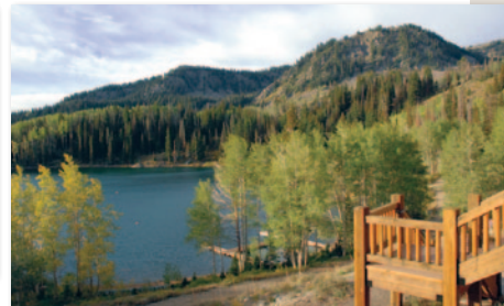
Lake Brimhall at Camp Cloud Rim.