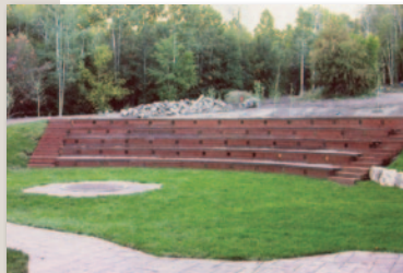
Both Camp Cloud Rim and Trefoil Ranch feature amphitheater facilities, such as the one above pictured at Trefoil Ranch.