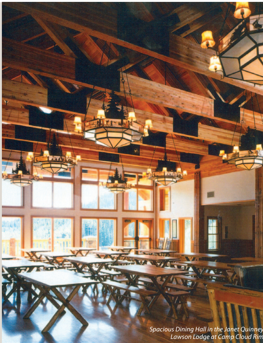
Spacious Dining Hall in the Janet Quinney Lawson Lodge at Camp Cloud Rim