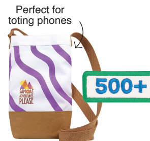
Eco Crossbody Tote and 500+ Bar Patch 500+ pkgs