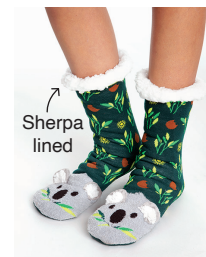
Koala Slipper Socks and 800+ Bar Patch 800+ pkgs