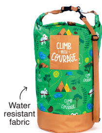
Camp Duffle Bag 1500+ pkgs