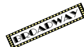
NYC Disney on Broadway 3 nights/4 days Date TBD (includes airfare, hotel, 2 Broadway shows, exclusive workshop and meals for the girl) 5500+ pkgs