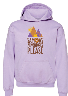
Samoas Hoodie 2000+ pkgs