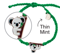
Koala Bracelet 250+ pkgs