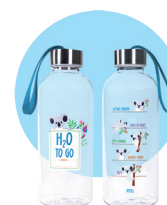
Water Bottle 100+ pkgs