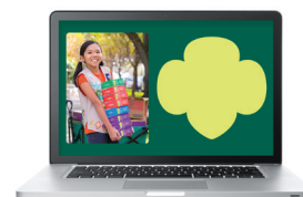
Laptop and programming experience 4000+ pkgs