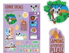
Cookie Decals 75+ pkgs