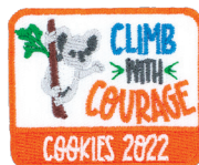
Climb with Courage Theme Patch 50+ pkgs