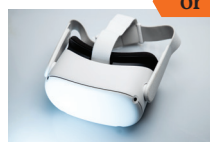
Oculus Quest 2 All-in-one VR Headset or AirPods Pro 2500+ pkgs