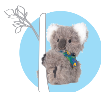
Clip-On Koala Upload a Digital Cookie Video by January 30, 2022