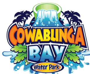
Cowabunga Bay Cookie Celebration 350+ pkgs