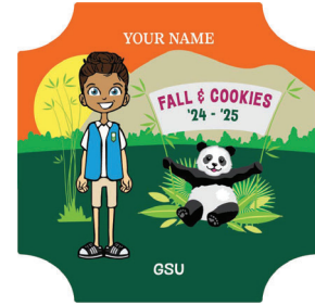
Crossover Patch 2024 Fall Product/2025 Cookie Patch Girl must meet the Fall Program criteria and sell 400+ pkgs of cookies