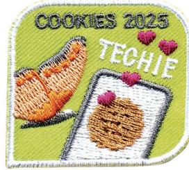
Cookie Techie Patch 25+ Digital Cookie Direct Shipped pkgs