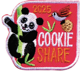
Council Gift of Sharing Reward Patch 25+ Digital Order GOC pkgs