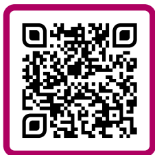
Troop Camp Rentals