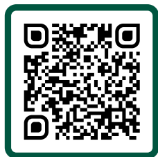
Troop Camping, Camporee, and Ranch Camp

Log in to our membership platform to register for minicamps.